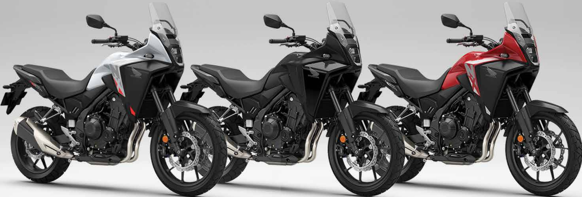
PEARL HORIZON WHITE