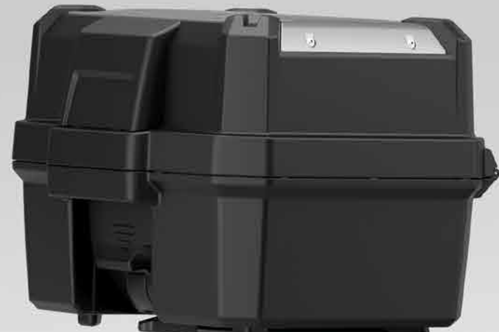
Top Box 38 L